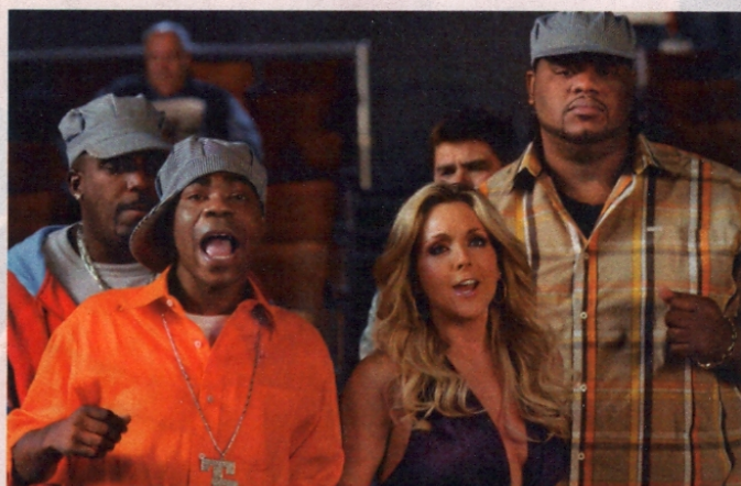
Morgan belts one out with 30 Rock costars (from left) Kevin "Dot Com" Brown, Jane "Jenna" Krakowski and Grizz "Grizz" Chapman

What was the most annoying thing about it? Sores. It's metal up against raw skin. Also, I'm diabetic. If I get a little scratch, it's hard for it to heal.